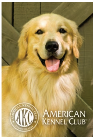
American Kennel Club Cat Fancier's Association