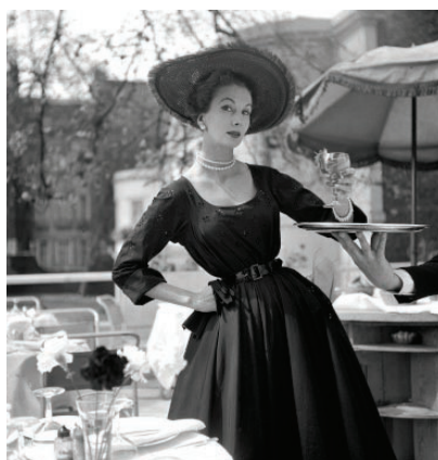
V&A Photographic Archives

The V&A began acquiring photographs in 1852 and its collection is now one of the largest and most important in the world. It holds over 500,000 images, by both classic and contemporary photographers, and illustrates a wide range of processes, techniques and subject matter.