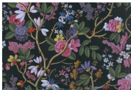
V&A Prints, Drawings and Wallpaper Archives

A magnificent collection of fine art prints, printmaking techniques and commercial graphics, as well as periodicals and manuscripts and access to more than a million items, including one of the finest collections of wallpapers in the world. Historic wallpapers from 15th century to contemporary, with examples from across the globe.