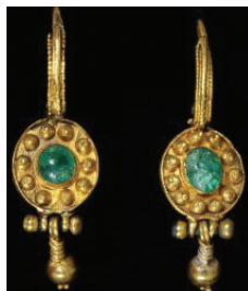
V&A Jewellery Collections

The collections also include accessories such as shoes, handbags and gloves.