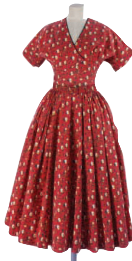
V&A Fashion and Costume Collections